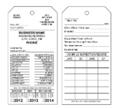
Example of a Service Tag

The code requires a fire extinguisher be installed in the kitchen area or within 10 feet of the kitchen on the way to an exterior exit. It must be in a visible location, not in a closet or behind a door. The extinguisher must be permanently installed using the manufacturers supplied brackets. The fire extinguisher must be rated for residential use, consisting of an A:B:C type; Rated a minimum of 2A-10BC, be no larger than a 10 pound fire extinguisher, and have a date on the label that is within one year of this inspection. An older extinguisher meeting the rating requirements which has an up to date service tag from an approved fire extinguisher service company certifying it is in working condition is acceptable. New extinguishers are not required to be serviced or tagged, as long as the seller or agent can provide proof of purchase or receipt.