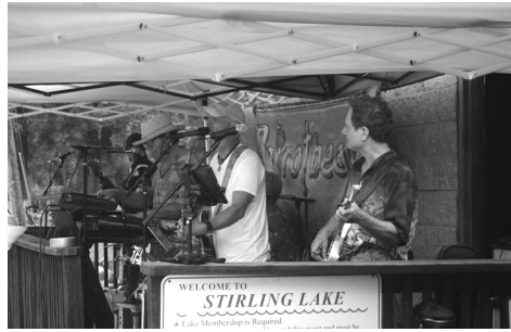
Parrot Beach will again perform at Stirling Beach this year.