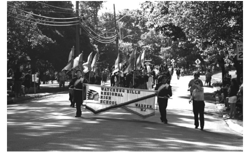
Come out for our annual Memorial Day Parade.

The summer is always our busiest time of the year in Parks & Recreation and we can't wait! This year we are pleased to welcome back a crowd favorite – Parrot Beach, a Jimmy Buffet tribute band. They will be back at Stirling Lake on Saturday, June 29, from 6:30 p.m. to 8:30 p.m., to usher in the summer with some great beach tunes.