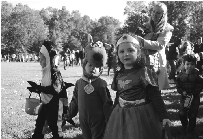
Our 2018 Halloween Parade

We hope everyone made some fun memories this summer and re-energized for the fall activities.